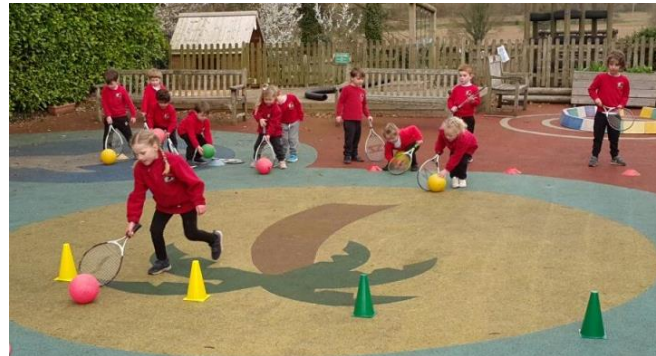
PE with Homer Green Sports Partnership