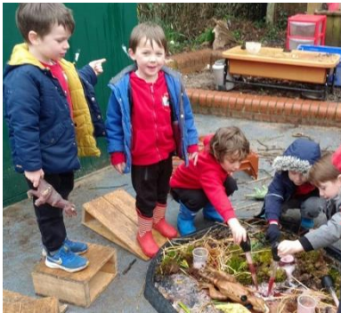
Digging for dinosaurs

Next week we will be turning our focus to Spring as many of the children have enjoyed spotting and talking about the spring flowers in the garden.